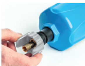
Externally Accessible Drain

Alpha deep pleated media technology delivers a step change in performance