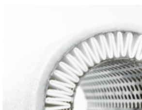
NEW Filtration Technology

Low cost connecting kits and new filter head design enables easy close coupling assembly